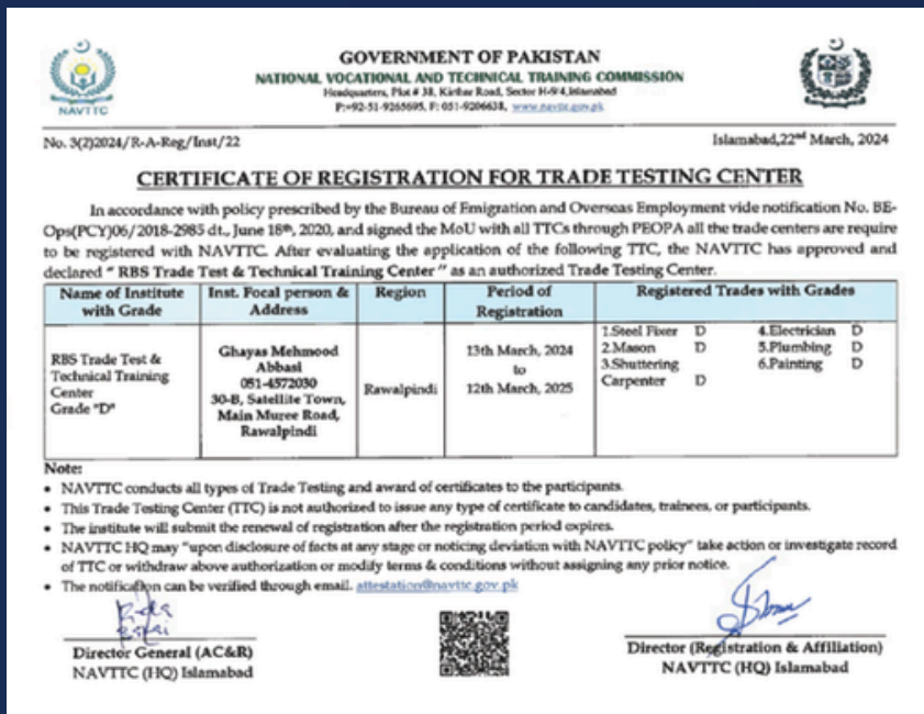
TRADE TESTING REGISTRATION CERTIFICATE