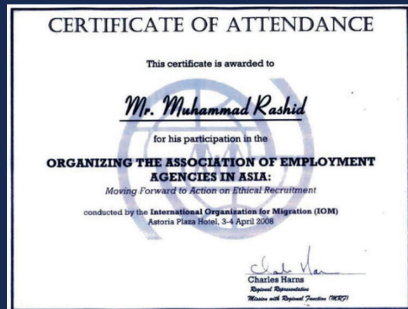
CERTIFICATE OF ATTENDANCE